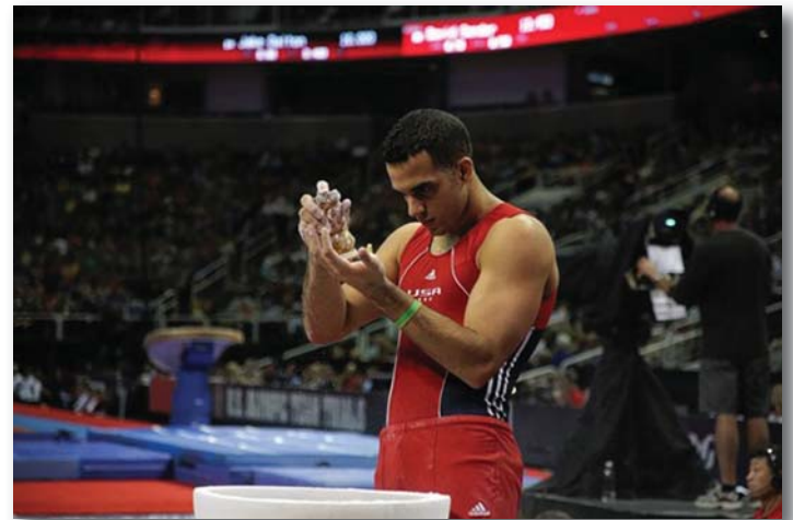
Bear Grip: U.S. gymnast Danell Leyva, right, squeezes just the right amount of the sticky stuff on to his hands before attacking the parallel bars.